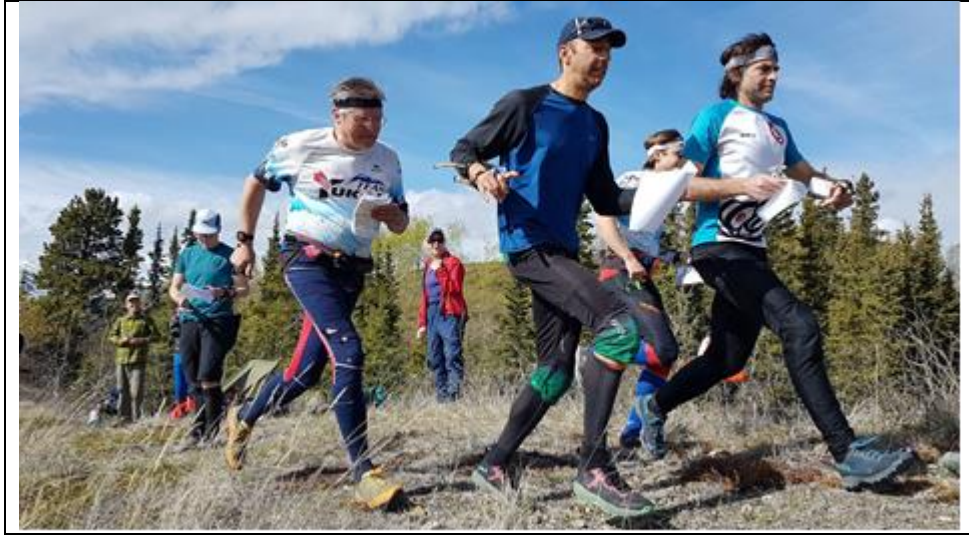
Participants set off on the long relay leg.