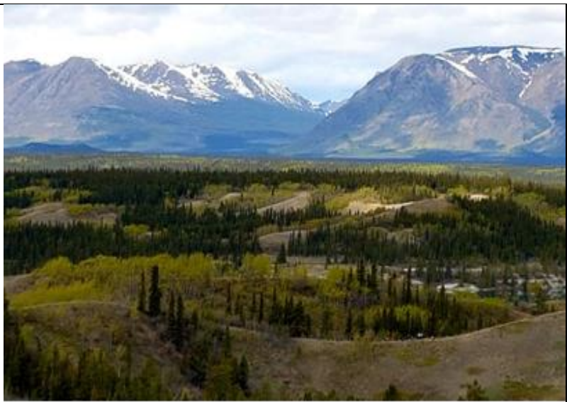
The long leg course, centred on the meadow bowl. Looking west to the start/finish area, lower right. Lewes Lake is just visible above the start/finish.