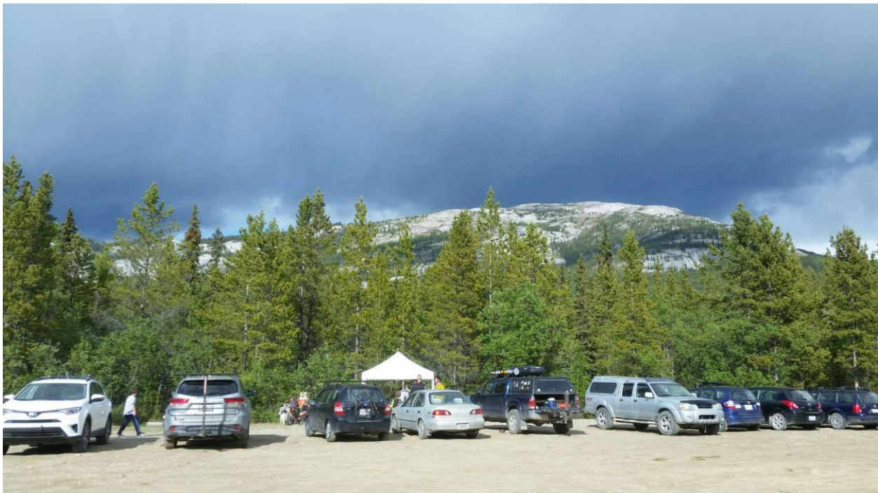
Dark clouds add an extra layer of challenge to tonight orienteering race.

Courses were relatively short in distance due to the physically challenging nature of the terrain—deep moss, rocky cliff sides and lots of deadfall made the forest running very demanding. None the less, Leif Blake powered through terrain and intermittent rain-showers to complete the Expert course 4 minutes faster than expected. Second and third place in the Expert course were the ever-strong Caelan McLean and Brent Langbakk in 30:20 and 32:24 minutes respectively.